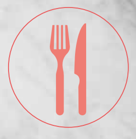
FEEL FULLER FOR LONGER