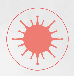
BOOST YOUR IMMUNITY