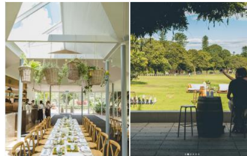
Examples of potential venue